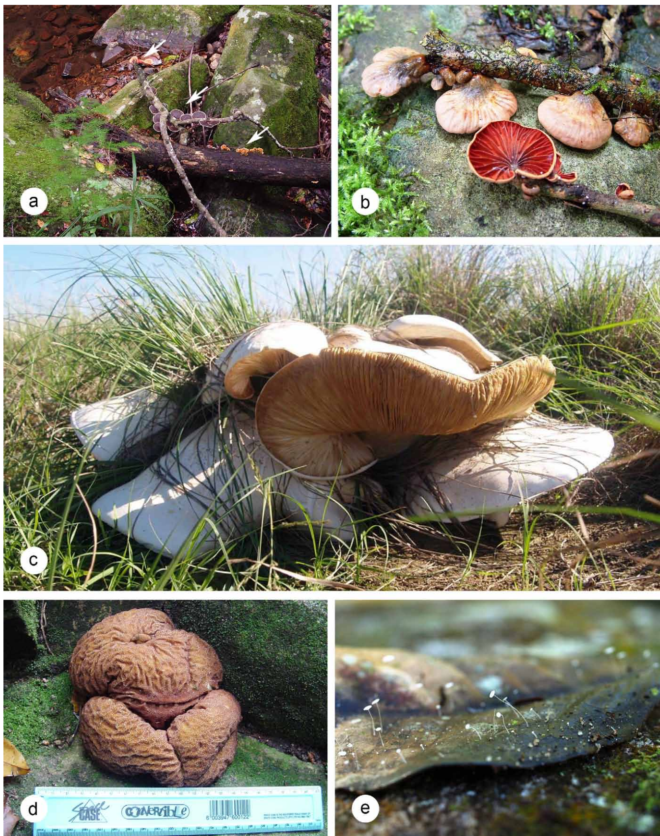
Fig. 1. Various types of larger fungi. (a) Three types of bracket fungi commonly found in forests; white arrow, the tropical cinnabar bracket ( Pycnoporus sanguineus ); grey arrow, the black cork polypore ( Trametes cingulata ); dotted arrow, the false turkey tail ( Stereum ostrea ). (b) Anthracophyllum archeri , a bracket fungus from Mpumalanga identified from an Australian field guide. (c) The gigantic Macrocybe lobayensis first discovered by a field guide user in the iSimangaliso Wetland Park, but remained unknown until the identity was obtained from an Australian mycologist. (d) An unknown fungus, still unidentified. (e) Minute basidiomes of a possible Mycena sp. on a rotting leaf.