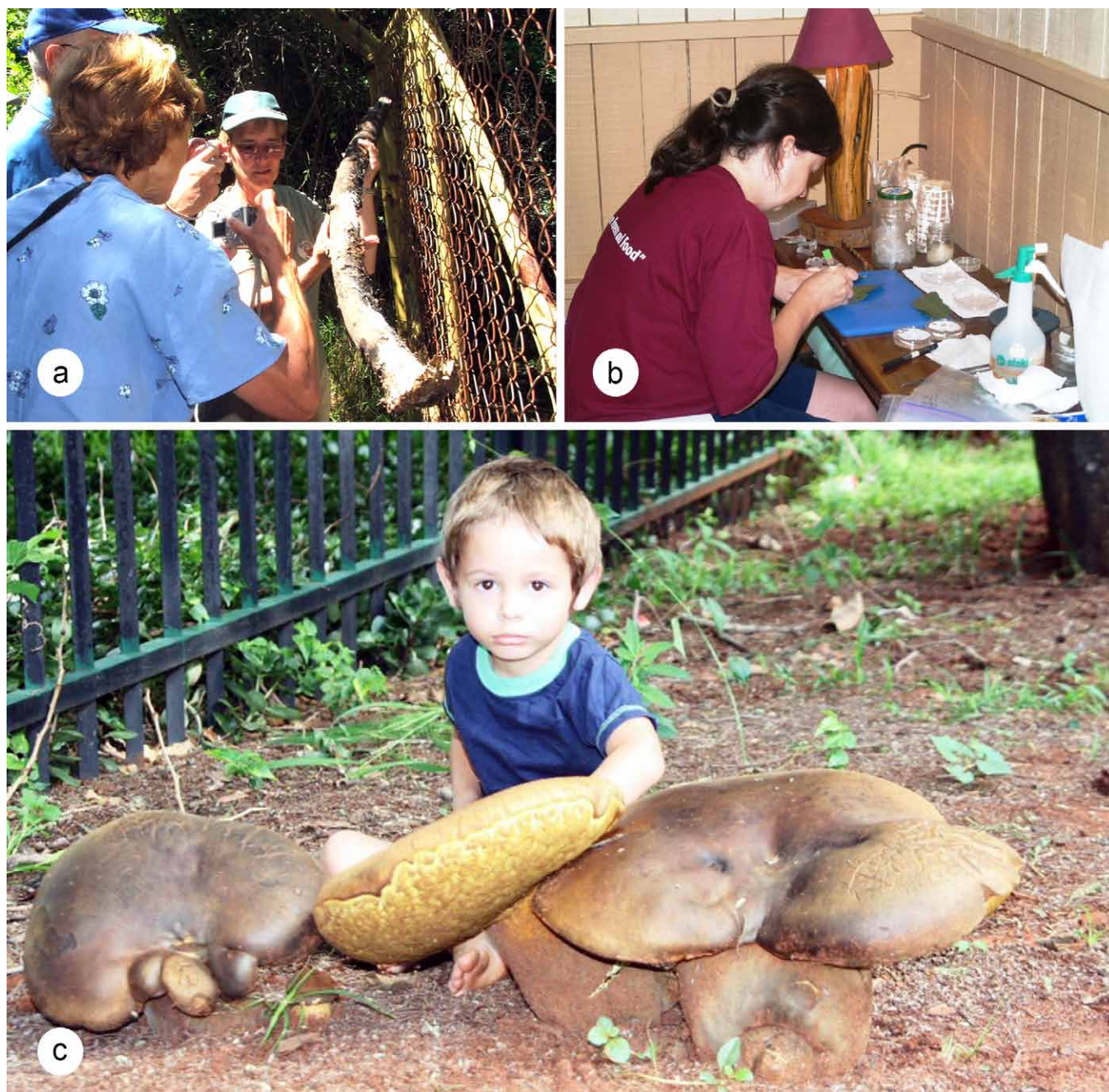
Fig. 3. (a) Eager participants of a fungal walk photographing fungi. (b) Typical isolation process for fungi after a collection trip. (c) Queries of unusual fungi are often sent by members of the public (in this case representing Phlebopus sudanicus , the bushveld bolete).

expanded by additional volumes containing different fungi, and not merely showing the same species as those in previous guides.